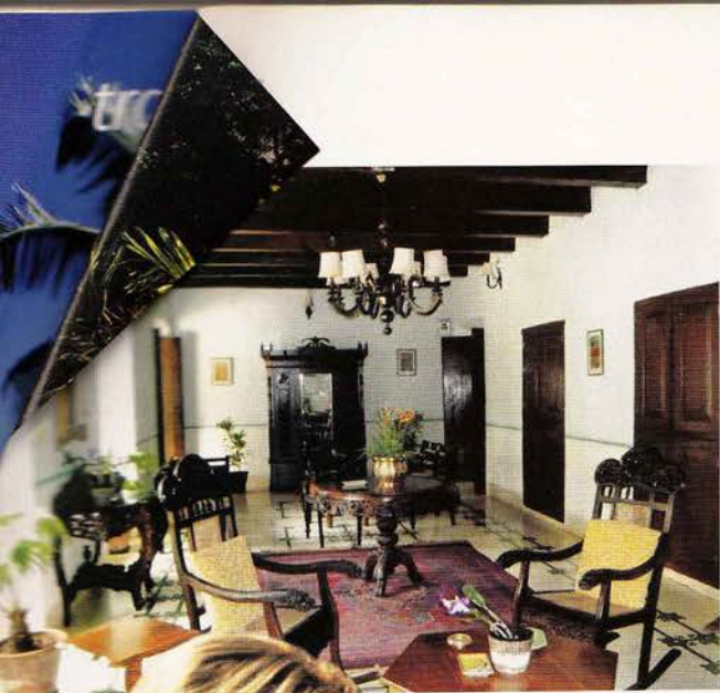
Clockwise from left, Kate Moss. Inside Siolim House. A room in Raj Angan